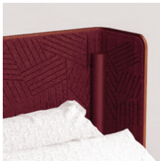
SAINT-PREX / Sleeping on the lake shore